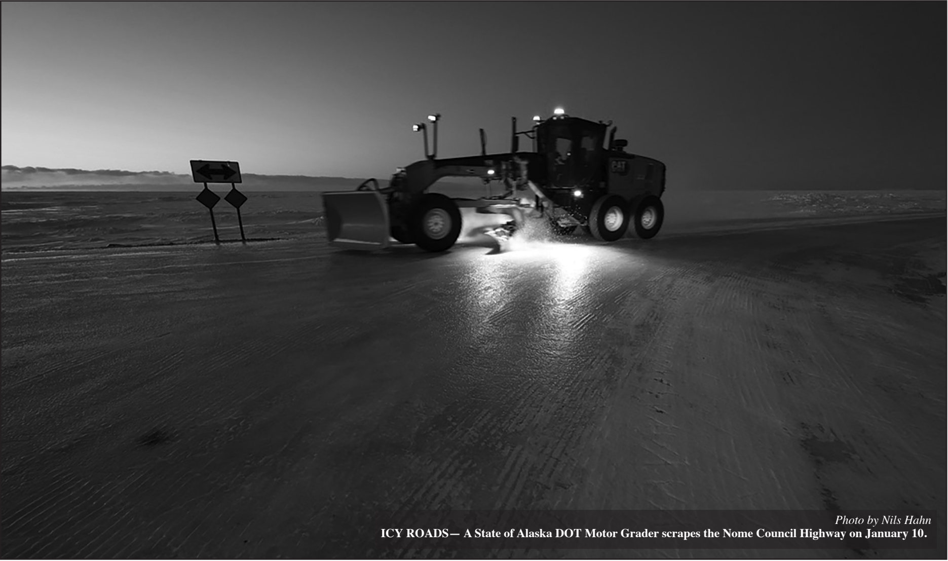
ICY ROADS— A State of Alaska DOT Motor Grader scrapes the Nome Council Highway on January 10.