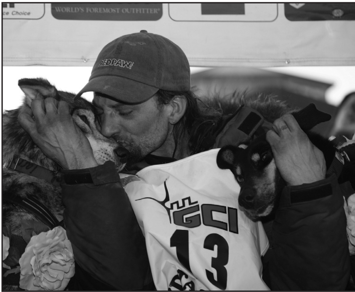
Nugget file photo 2007 IDITAROD— Lance Mackey won the 2007 Iditarod, the first of four wins.