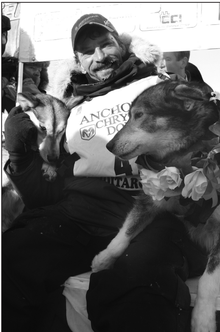
Nugget file photo 2009 CHAMPION— Lance Mackey celebrates with his lead dogs at the finish line in Nome after the 2009 race.